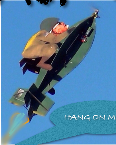
HANG ON MORT!